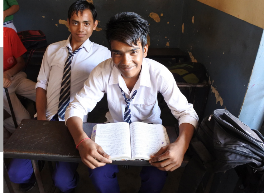
Two of the 7th grade boys studying together, take a moment to smile for a picture.

When speaking with students, we were amazed at how curious they were about their health. As a result, we had a health seminar. We talked about healthy eating habits, proper sleeping habits, good dental hygiene, and the importance of family and friends in feeling happy.