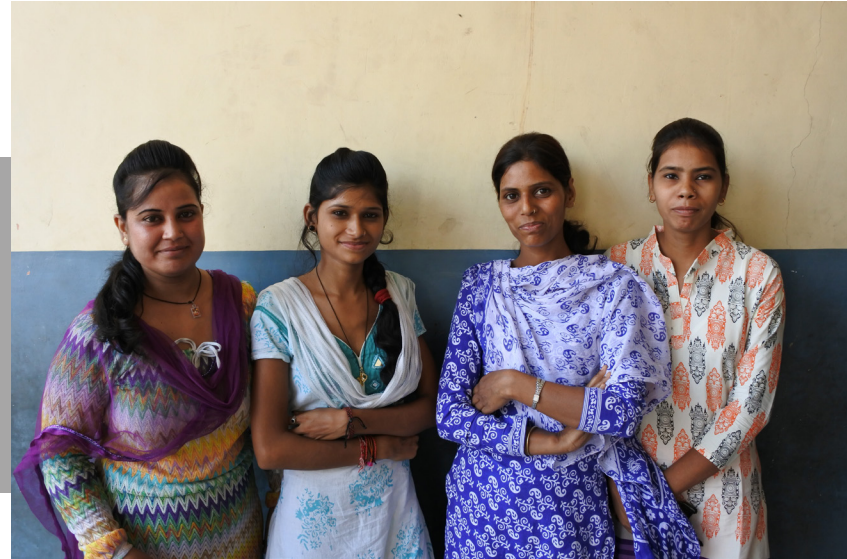
These women are the dedicated teachers for the Sanjay School.

At IndoRelief, we believe our patients come first. This is why we speak with community members before planning any health project. We want to understand what they want. We spoke with the school's teachers and with the families whose children attend the Sanjay School. For them helping their children avoid potential illness is a priority. As a result, we are focusing our efforts on providing vaccinations, antibiotics treatments, and any surgical procedures if necessary.