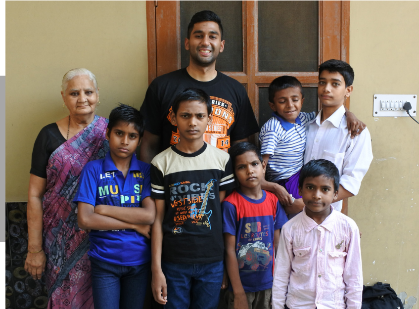
The boys stand with Amma ji, the caretaker, who has now become like a mother to them.

The problem: At least 45 million children in India are child laborers. They work various jobs, such as sewing clothing in factories, picking crops in fields, and building houses. They may work over 12 hours a day, with little food. Many child laborers are orphans. They work to support themselves. At IndoRelief, we want to show these children that they are not forgotten.