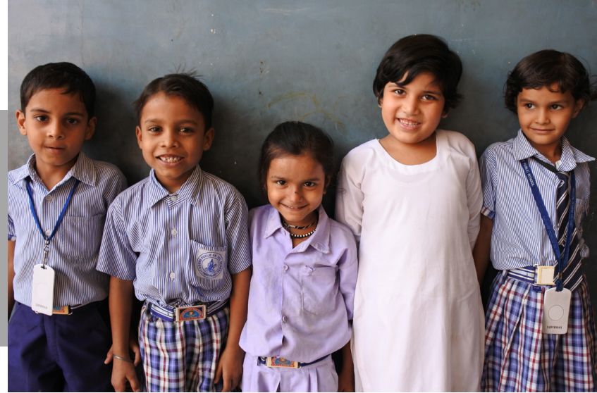
The younger students at the school were all smiles after their dental health check up.

In helping the Sanjay School, we want to provide high quality healthcare for future generations of children. We will be working closely with teachers and the school's principal to create a health curriculum for the students. We hope these health classes will prepare the students for good health in their futures and set them on their way to accomplishing their dreams.